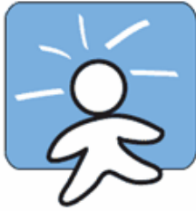
Plate forme européenne de la société civile pour l'éducation tout au long de la vie European Civil Society Platform on Lifelong Learning